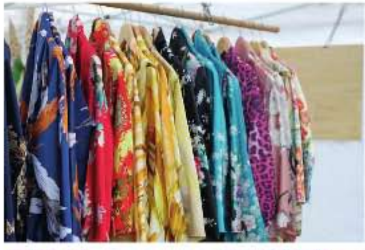
LEFT: Shop for stylish vintage wear at Village Markets

EVENTS // PROFILES // FOOD // DRINKS // PLACES // STYLE